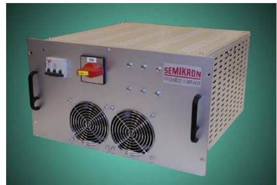
Finished Chorus Meshcon Inverter Enclosure

Instead of trying to work with new materials or a new control paradigm, we have cheerfully adopted all of the excellent incremental work done in the three-phase world. We use standard materials, standard bearings, and standard control modules. This is why it is possible for Semikron® Limited to make our drives, and a normal motor manufacturer can wind a Chorus machine. Our building blocks are the same — we just think about the way those blocks should be assembled differently from anyone else. And what makes it all so much fun is that our motors and drives outperform any other system and we provide a huge increase in the size of the available engineering envelope.